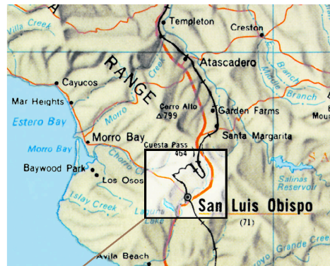
Cal Poly Land in San Luis Obispo County

In San Luis Obispo County, Cal Poly Land lies between five and 12 miles from the Pacific Ocean. The double-page spread on the overleaf shows